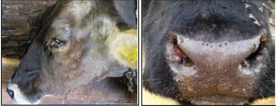
Figures 5-6: Conjunctivitis, nasal discharge, ulceration of lesions in muzzle