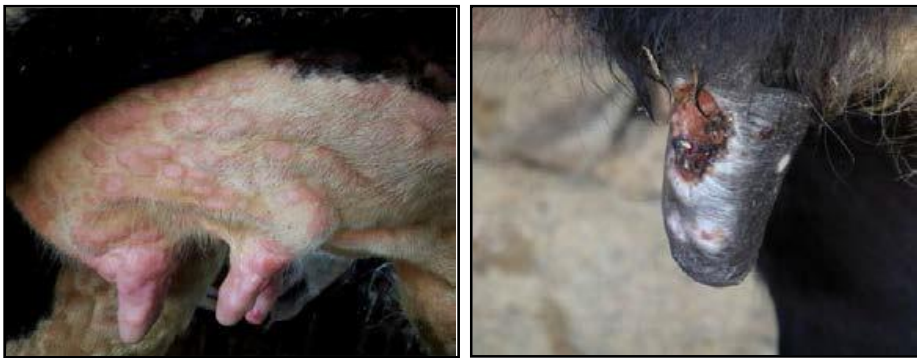
Figures 7-8: Skin nodules in udder and teats and ulceration of lesion in teat