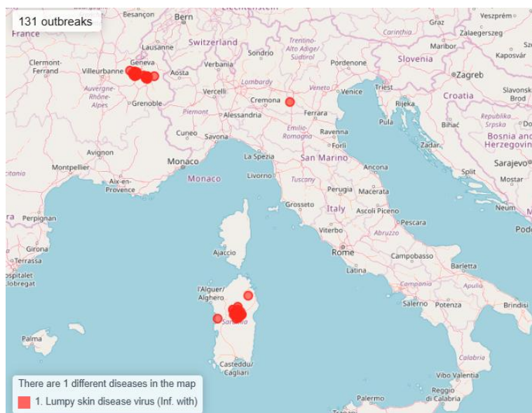
Figure 1: Location of LSD confirmed outbreaks since 21 st June 2025 to date.