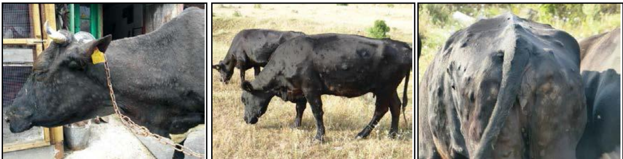
Figures 2-4: Skin nodules and enlarged lymph nodes