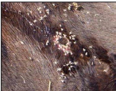
Figure 9: Skin lesion with a scab attracting domestic flies